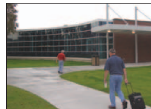
A new library, wireless technology and student gathering spaces are part of the new College Center.

Both buildings also received new roofs and mechanical and electrical upgrades.