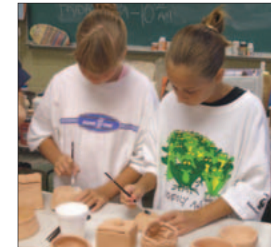
Two middle school students create pottery during one of the Summer 101 arts classes.

Students can choose from three new associate degrees that started at SC4 this fall. An international business associate degree gives students a comprehensive look at international trade, monetary systems, cultural differences and international politics. The new associate degree in landscape design, turf and greenhouse management enhances SC4's former horticulture associate degree. And a new mechatronics degree merges mechanics, electronics, robotics and computer programming.