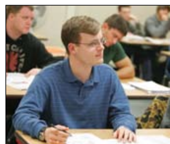
SC4 is one of a dozen organizations collaborating to increase the number of St. Clair County students completing at least an associate degree.

Ten school districts and colleges, the Community Foundation of St. Clair County and the Economic Development Alliance of St. Clair County are partners in the initiative.