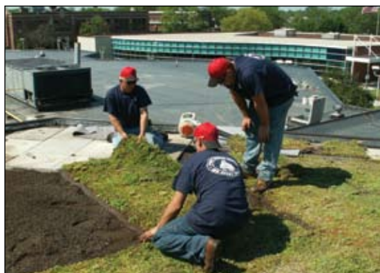
Workers in June install a green roof atop a portion of SC4's Fine Arts Building.

For more information about SC4's alternative energy program, visit www.sc4.edu/energy .