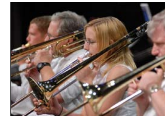
Members of the SC4 Jazz Band perform July 26 in the college's Fine Arts Theatre as part of the Twilight Concert Series.

Throughout 2008, SC4 celebrated the 85th anniversary of its founding in 1923. Twenty-two SC4 and SC4 Alumni Association representatives participated in the Rotary International Day Parade on July 9 in downtown Port Huron. The college and alumni association also presented Homecoming festivities July 10 with a special Homecoming tent on the lawn in front of the gym. Faculty and staff socialized with alumni, family and friends. And in honor of the anniversary, the SC4 Foundation used a 1920s theme for its Red Carpet Affair gala Oct. 25.